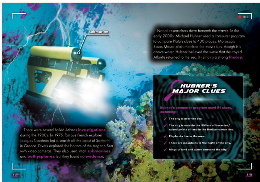
Sample spread from Atlantis